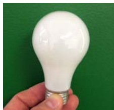
Less than 75 watts

Ultra Efficiency: Required power is less than it takes to run a 75 watt light bulb. linear will actuate over 5,000 cycles, rotary over 10,000 cycles on the optional internally mounted Back-Up Power Supply.