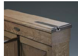
Oak w/Bronze Guide

Site-Specific Cabinets: Every project is unique! Create something challenging and spectacular!! Aeroturn can provide unlimited shape and material options .... ... Stainless, Wood, Corian, Stone, Plastic, Aluminum, Marble, Bronze and Granite. Aeroturn provides complete engineered solutions.