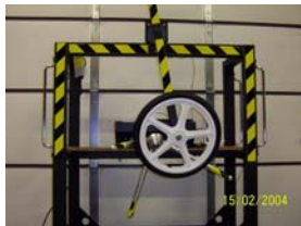
Factory Testing - Cycling Fixture

Zero-Maintenance Mechanics: Engineered with the End-User in mind. All mechanisms must withstand continuous duty Cycle Testing without requiring maintenance and/or service before becoming a production Turnstile: rotary @ 10,500,000 cycles, linear @ 7,500,000 cycles, portal @ 10,000,000.