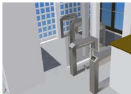
3-D Site Modeling

Turn-Key Factory Support: Aeroturn becomes the "Turnstile Engineering Department" as well as the "Turnstile Manufacturing Facility" of our Customers. Engineering and production departments can be reached directly during any phase of your project. Factory Vehicle is fully equipped for your job site requirements.