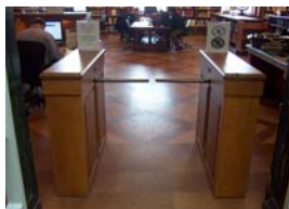
Baker Library - Harvard University

This Century's Passageways: The rotary eliminates knee-knocking and walking thru sideways with its "Unobstructed Passageway". The linear can secure a passageway up to 72". The portal uniquely wraps and stores giving more passageway and less cabinet than current Glass Panel Units.