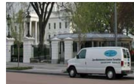
Job Site Support

Turn-Key Factory Support: Aeroturn becomes the "Turnstile Engineering Department" as well as the "Turnstile Manufacturing Facility" of our Customers. Engineering and production departments can be reached directly during any phase of your project. Factory Vehicle is fully equipped for your job site requirements.