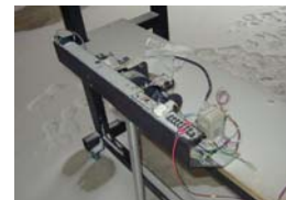
Testing in the Snow

Library Quiet: Both the rotary and linear Mechanisms are virtually silent. Either can be used in any application. The circulation desk and student work spaces are only 18" from the linear unit shown in the photo at left.